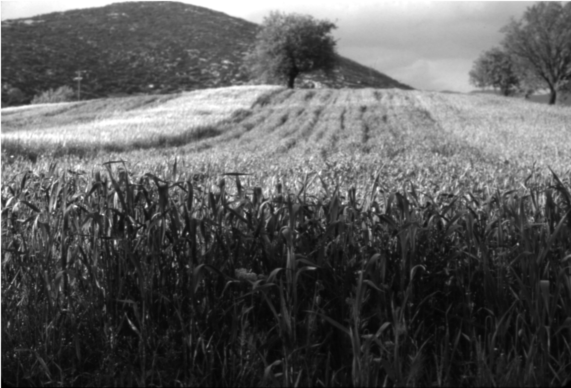
General view of the site of Ayioryitika in 1987, looking north.